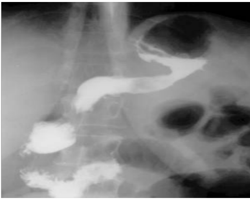
Figure 1: Radiograph on the stomach with mono-contrast: The stomach is with increased rigidity of the wall and markedly reduced volume, with distorted or absent mucosal folds in the region of the corpus and antrum. The stomach loses its ability to distend. Typical finding for the diffuse type of gastric cancer of scirrhus type or linitis plastica.

(Figure 2) The finding is in favor of the neoinfiltrative process of the stomach-linitis plastica.