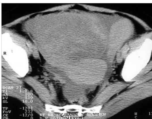
Figure 6: CT of the abdomen and pelvis: Two large soft tissue TU formations that originate from the ovaries are seen in the pelvis and a free fluid is seen in the peritoneum. TU masses are with expressed and heterogeneous contrast enhancement. Finding for MS changes in the ovaries and peritoneum.

( Figure 5 ) Parenchymal abdominal organs do not show signs of secondary pathological deposits, they are with neat structure and morphology. A collection of ascites fluid is perihepatic and peri-splenic, between the intestinal loops, paracolic gutter as well as in the pelvis, which is in favor of MS changes in the peritoneum. There are no enlarged mesenteric and paraaortally lymph nodes, but there is no exclusion of secondary pathological deposits in them. The right kidney calyx system is deformed, dilated and distended in favor of hydronephrosis of II degree, and the left kidney is with no patologic changes. The proximal part of the right ureter is dilated due to compression from the tumor mass in the pelvis. The intestinal loops in the pelvis are stagnant, and pushed laterally by soft-tissue tumor formations, which are non-homogeneous, predominantly solid, but with apparent zones of destructions that belong to the ovaries. The larger tumor mass belongs to the right ovary ( Figure 6 ).