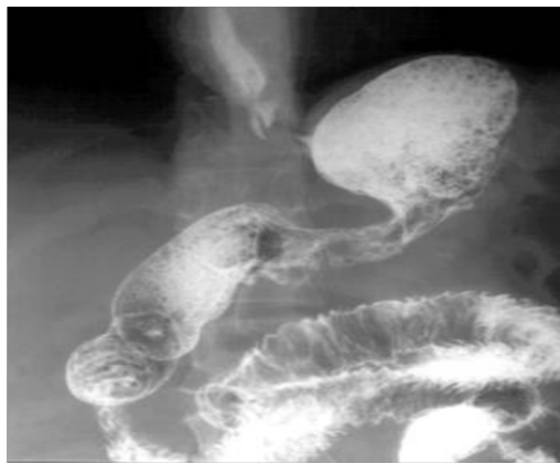
Figure 2: Radiograph on the stomach dual-contrast: After the application of an effervescent agent, the stomach remains with a markedly reduced volume and an expressed desmoplastic reaction to the wall. Identical finding as for the figure 1.

(Figure 2) The finding is in favor of the neoinfiltrative process of the stomach-linitis plastica.