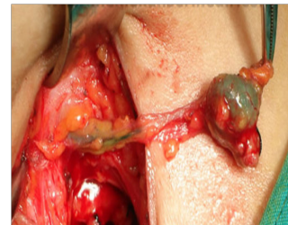
Figure 1: Multicycliclesion in hernia sac.

A55 yeras old patient with no know ncommon disease and no family history admitted to emergency clinic with complaints of painful swelling in ther ightinguinal region. There was a work-ing history in the dyefactory. When the etrangule right ingui-nal hernia findings were detected on the physicaalexamination of the right inguinal region an emergency operation decision was made for the patient [1-4]. During surgery, massive degenera-tive elastic mass lesions were detected in the right inguinal her-nia sac and in dimensions of approximately 3x2 cm ( Figure 1 ). Mass excision was performed and the inguinal hernia was re-paired with prolen graft.The pathologic ezamination result was epitheloid type malignant mesothelioma ( Figure 2 ). The patient was consulted to medical oncology section and pemetrexed and cisplatin treatment started to the patient. At the 6th month computed tomography (CT) revealed a few hypodense nodular lesions in the liver, splenic flexure, mild wall thickening in the transverse colon, and free fluid between the intestins. No further pathology was detected except Positron eemission tomography / CT except mild hypermetabolic nodular lesions in thelung (nod-uleswithSUDmax: 3.70, 12 mm in size). The patient was diverted to medical oncology for further continued therapy of palliative chemotherapy.