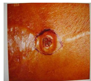
Figure 2: Clinical picture of the skin cancer. The tumor 2x2 cm2 in size was located at the previous wound of ALT flap donor site.